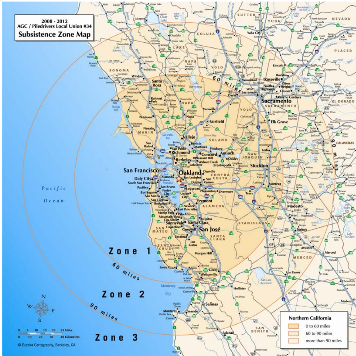
EXHIBIT A SUBSISTENCE ZONE MAP